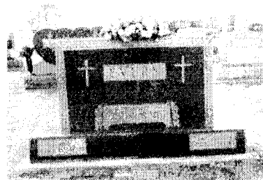
Added by: tut