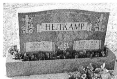
Added by: corgilover