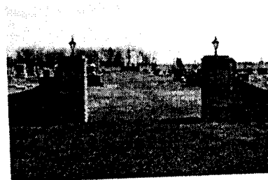
Cemetery Photo Added by: LKlaer